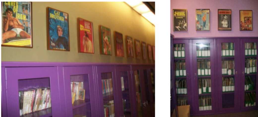
Figure 3. The Pride Library's Closet Collection

The Pride Library also transforms informational materials into aesthetic objects through the Closet Collection display. As I documented from a conversation with Professor Miller in my fieldnotes, Professor Miller approaches the Pride Library's Closet Collection as an "art installation" by housing the books in half-length bookshelves with glass fronts with a purple exterior. Above the shelves are a series of enlarged images from the covers of the books from the collection (see Figure 3).