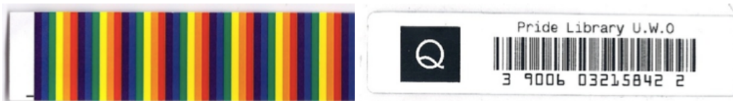
Figure 1. A close-up of the rainbow strips used to flag Pride Library book spines and the CombiTag with the Pride Library’s signature Q

The book flagging process at the Pride Library suggests that materials are marked as different much in the same way as the Pride Library’s space is different from the D. B. Weldon Library proper. On a purely functional level, the Pride Library needs to mark their books because the D. B. Weldon Library’s circulation department handles the Pride Library’s book circulation. As a result, marks such as rainbow “flags” and unique CombiTag design (see Figure 1) help ensure that Pride Library materials are not accidentally re-shelved in D. B. Weldon.